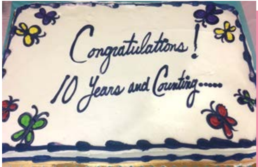
Above: Monarch honors a decade of achievements.