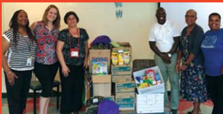
The Children's Guild School of Prince George's County welcomes a generous donation from the Naval Engineering Logistics Office.