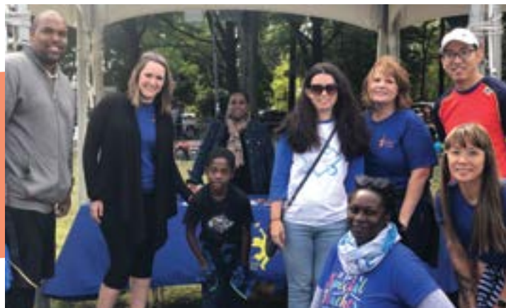
Right: Staff along with students and their families participate in a local walk for autism awareness.