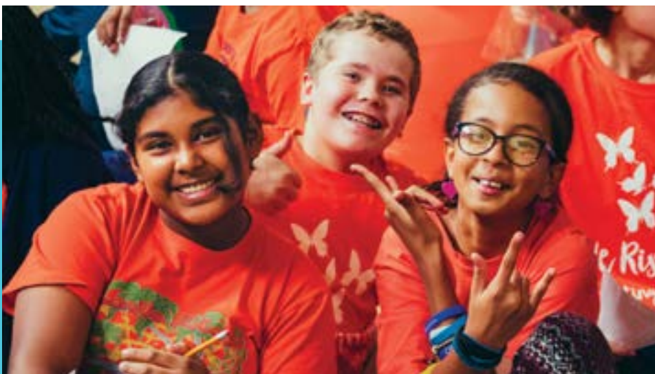
Above: Students express their solidarity against bullying.