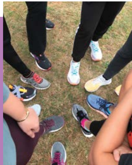
Above: Staffa House girls show off their new athletic shoes.

Thank you to everyone, especially the staff at The Children's Guild Alliance headquarters, for volunteering, donating, and supporting this project. Staff and their family and friends are all pitching in to make this a really special experience for our Staffa House girls. They are enjoying themselves and love their new shoes.