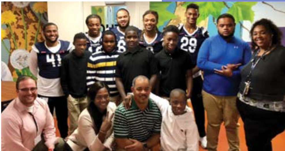
Howard University football players visit The Children's Guild DC Public Charter School to read to elementary school students.