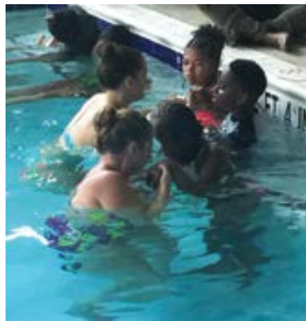
Above: Our staff helps with the swim lessons.