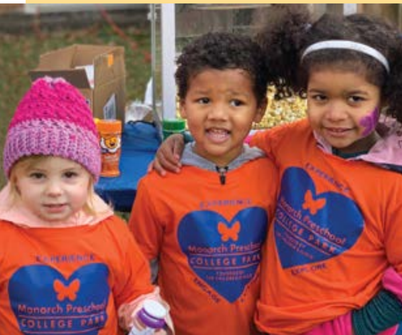
Children have fun at Monarch Preschool College Park open house.