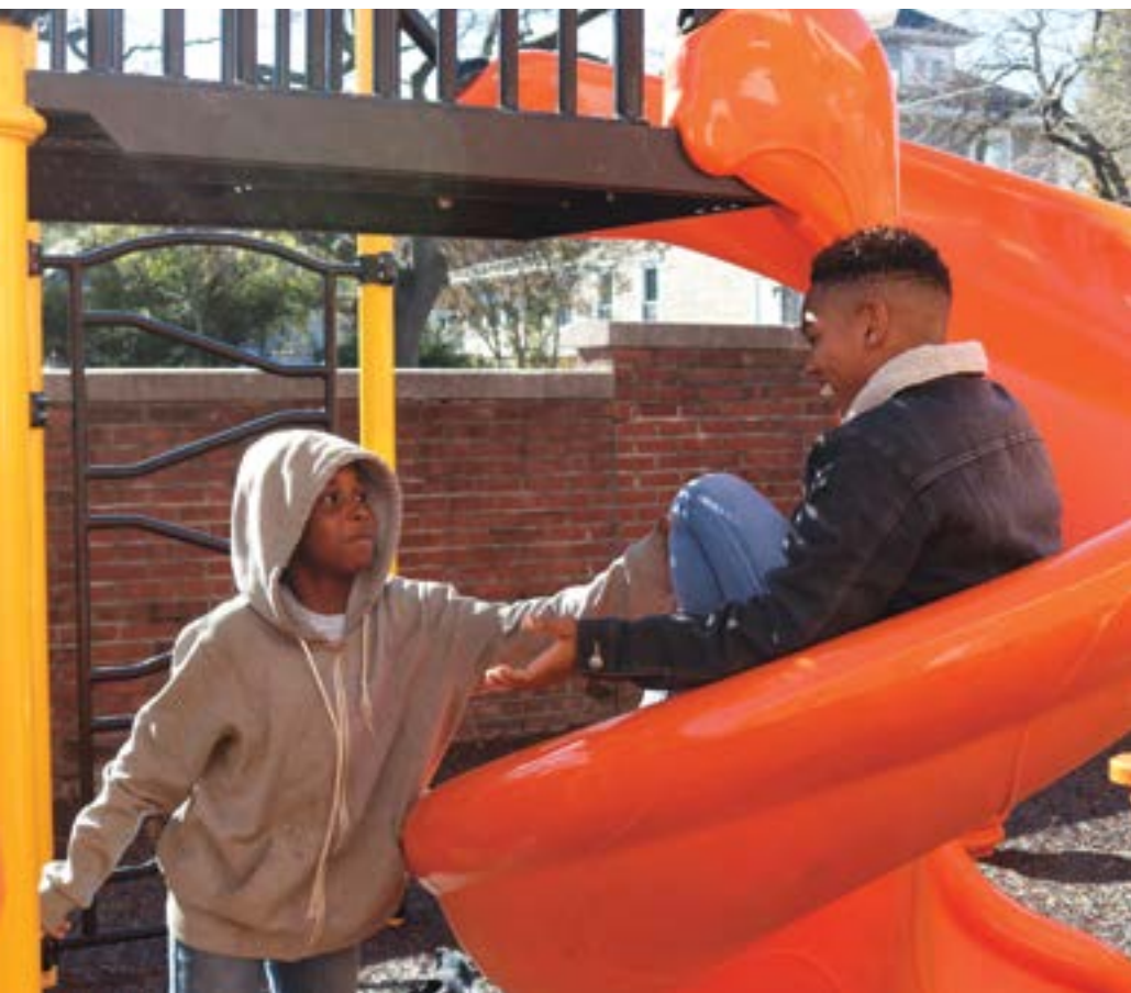
Above: Students have fun on the slide.