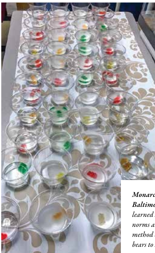
Monarch Academy Baltimore's students learned about lab norms and the scientific method by using gummy bears to study osmosis.