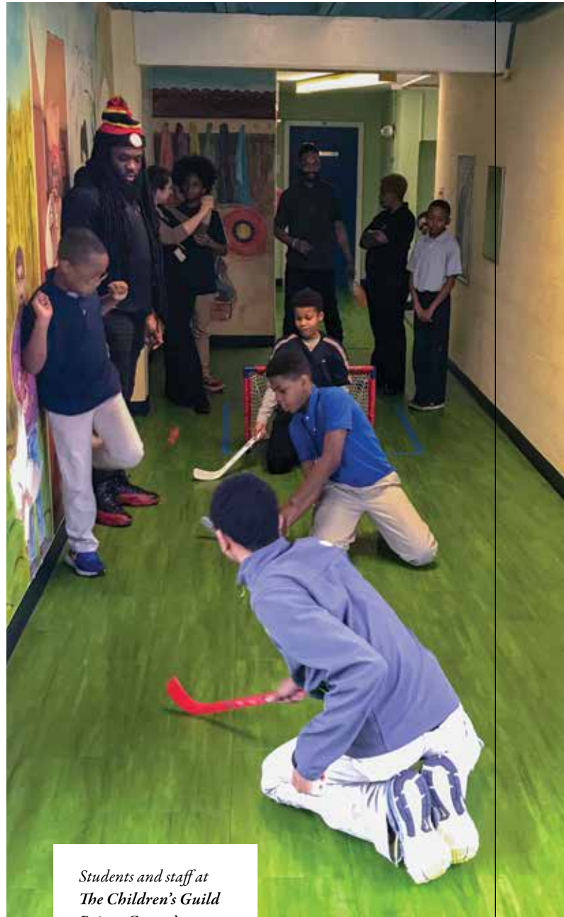
Students and staff at The Children's Guild Prince George's County campus participated in friendly, but very competitive, Olympic-themed games.